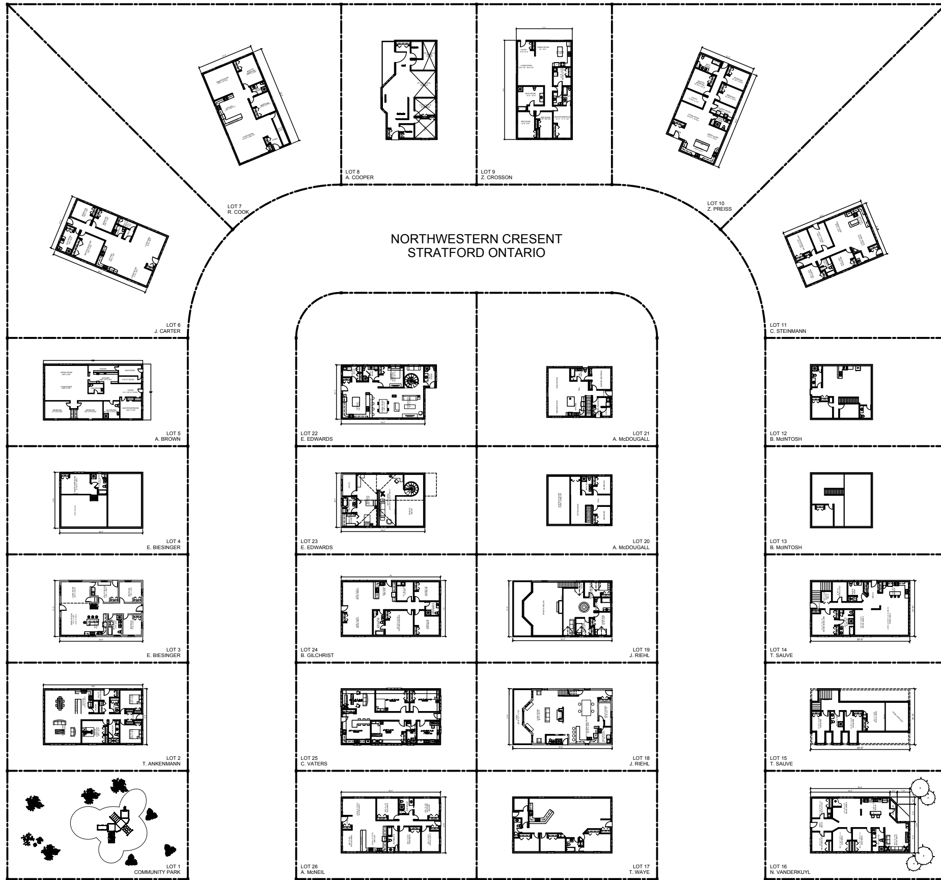
PLAN OF SUBDIVISION NOT TO SCALE